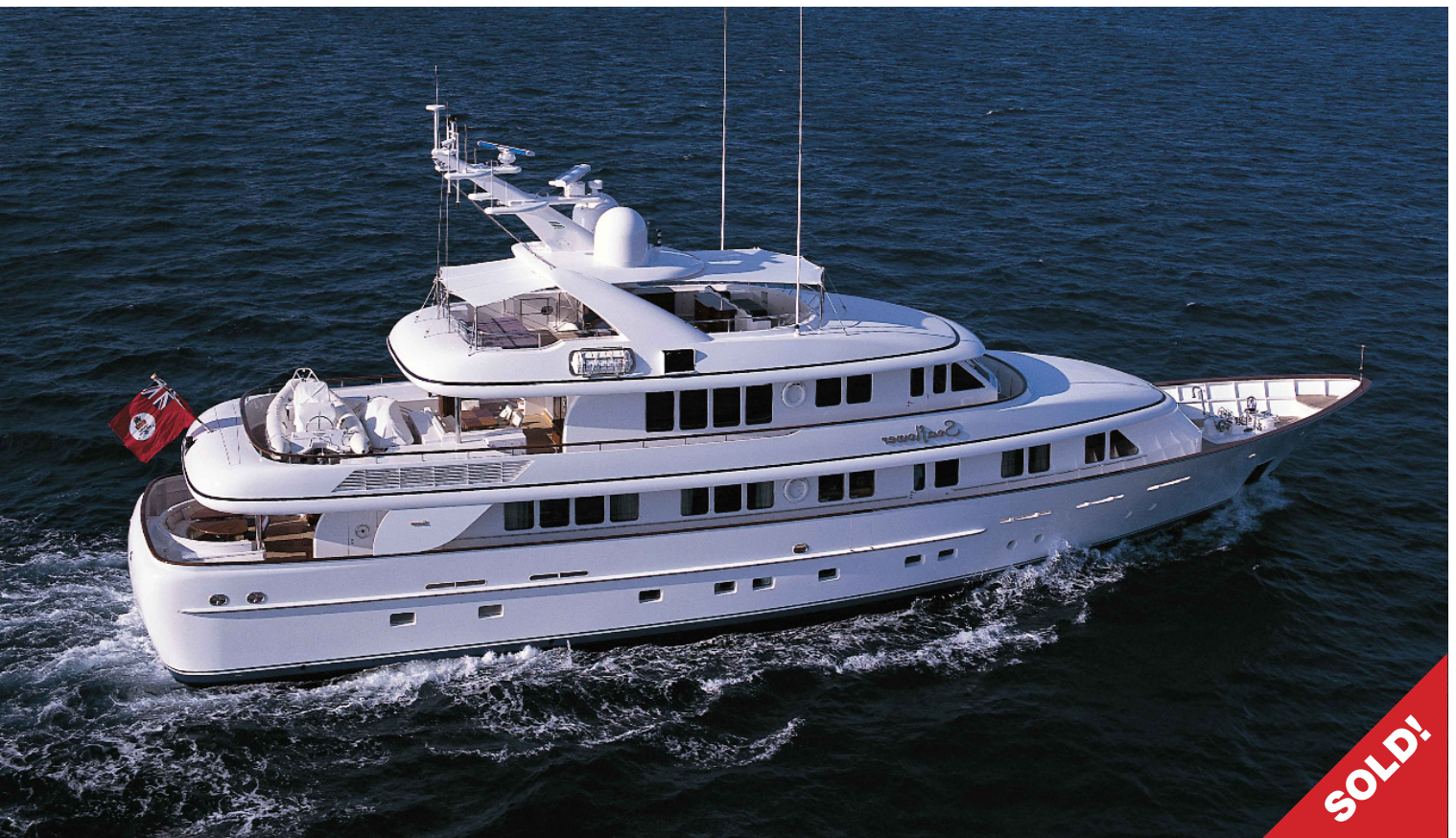
M/Y Seaflower, 131' Feadship, 2002, sold by Neff Yacht Sales. Twice!