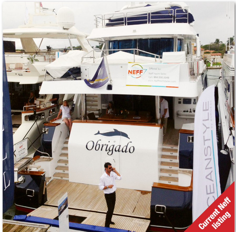
M/Y Obrigado, 98' MCP, 2006, at the Miami International boat show.

We make them aware of the availability of every one of our listings and offer them the larger share of the commission to bring their Buyers. We stay in touch with regular email blasts to every (4,900) Yacht Broker in the World with each location change, price change and open day notice.