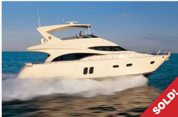
59' Marquis, 2008. Sold by Neff Yacht Sales.